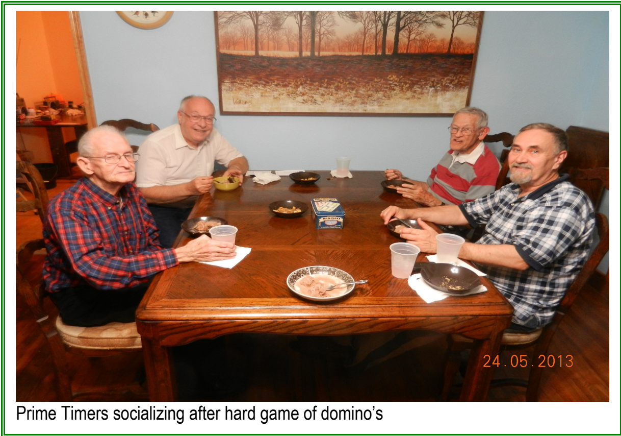
Prime Timers socializing after hard game of domino's