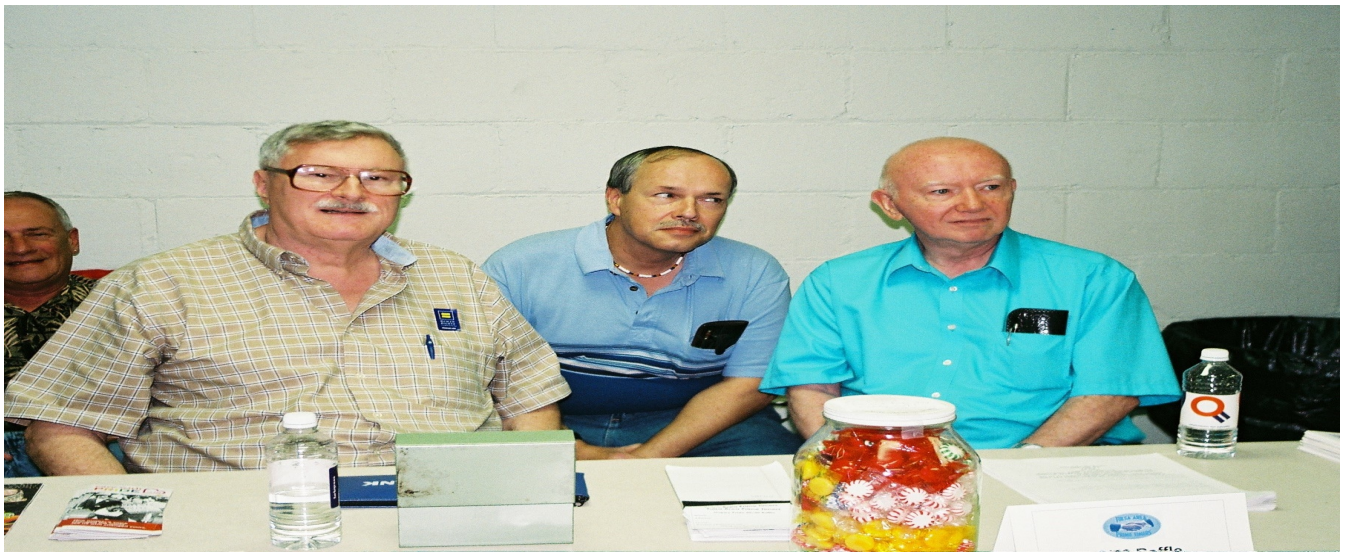
TAPT booth at Tulsa Pride 2013 looking for new members