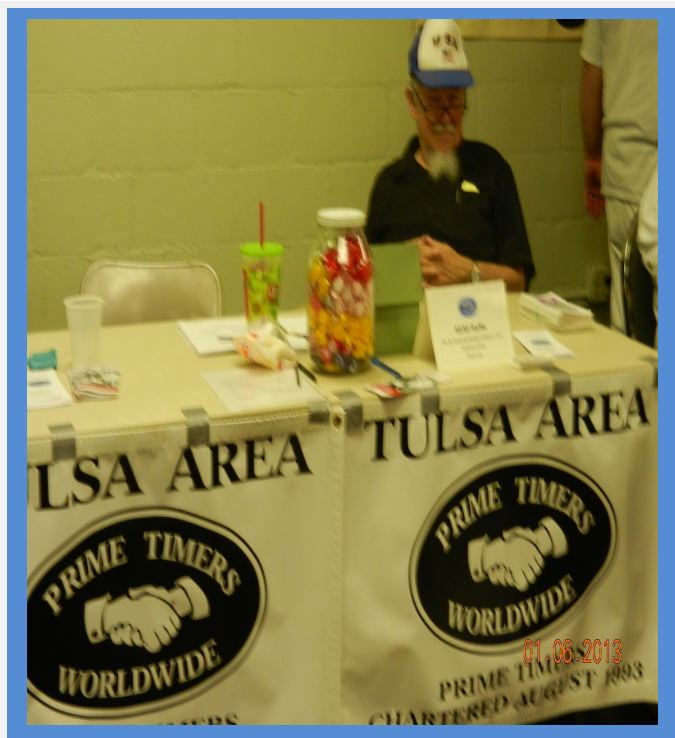
TAPT booth at Tulsa Pride 2013 guarding the raffle jar.