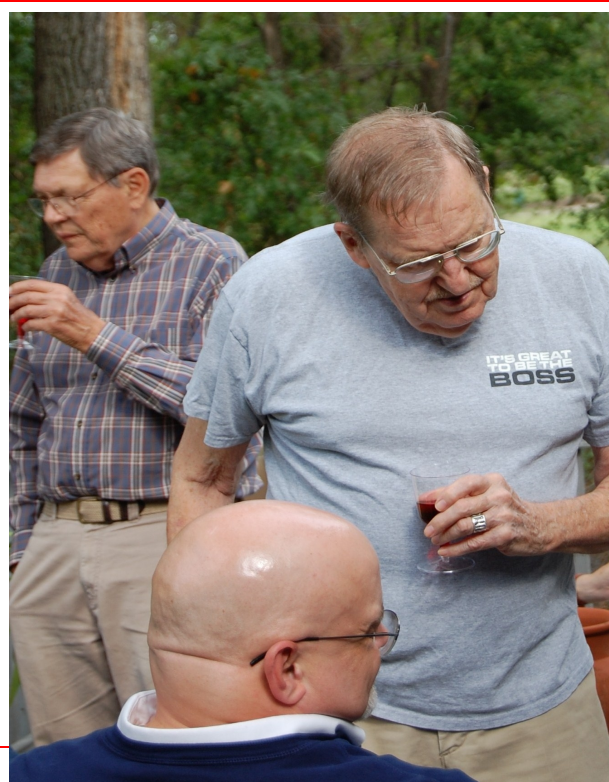
Can we get the boss to join?