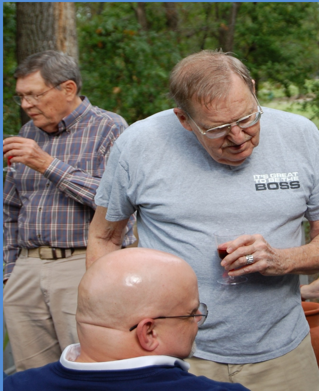
Prime Timers doing what they do best "Talk"

A farmer near Dubbo got pulled over by a Highway Patrol Officer for speeding. The officer started to lecture the farmer about his speeding, and in general began to throw his weight around to try to make the farmer feel uncomfortable. Finally, the officer got around to writing out the ticket. As he was doing that, he kept swatting at some flies that were buzzing around his head. The farmer said, "Having some problem with circle flies there, are ya?" The officer stopped writing the ticket and said, "Well yeah, if that's what they are. I never heard of circle flies." So the farmer says, "Well, circle flies are common on farms. See, they're called circle flies because they're almost always found circling around the back end of a horse." The officer says, "Oh," and goes back to writing the ticket. Then after a minute, he stops and says, "Are you trying to call me a horse's ass?" The farmer says, "Oh no, officer. I have too much respect for law enforcement and police officers to even think about calling you a horse's ass." The officer says, "Well that's a good thing," and goes back to writing the ticket. After a long pause, the farmer says, "Hard to fool them flies though".