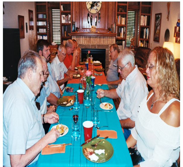
Serious Prime Timers when it is desert time.