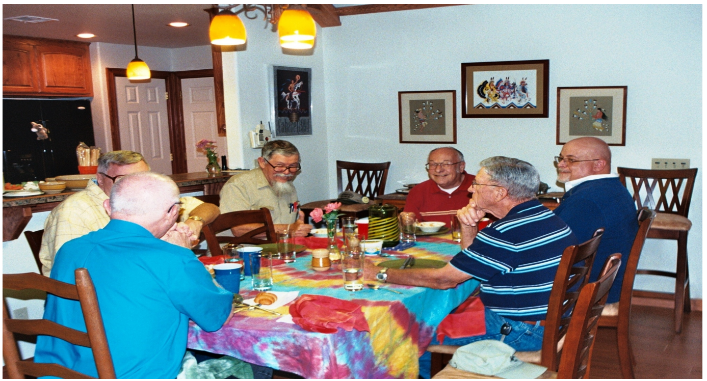
Smiling Tulsa Area Prime Timers after a great meal