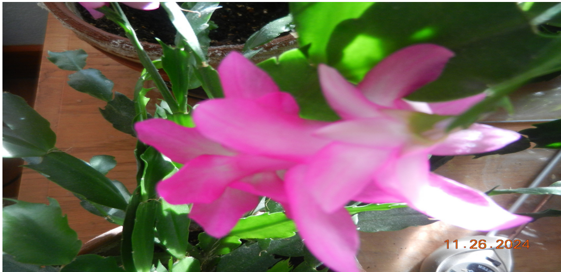
Christmas is a coming my cactus has bloomed