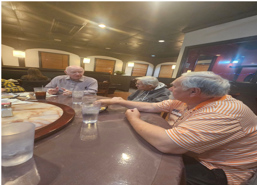
Prime Timers at Dine Out in November