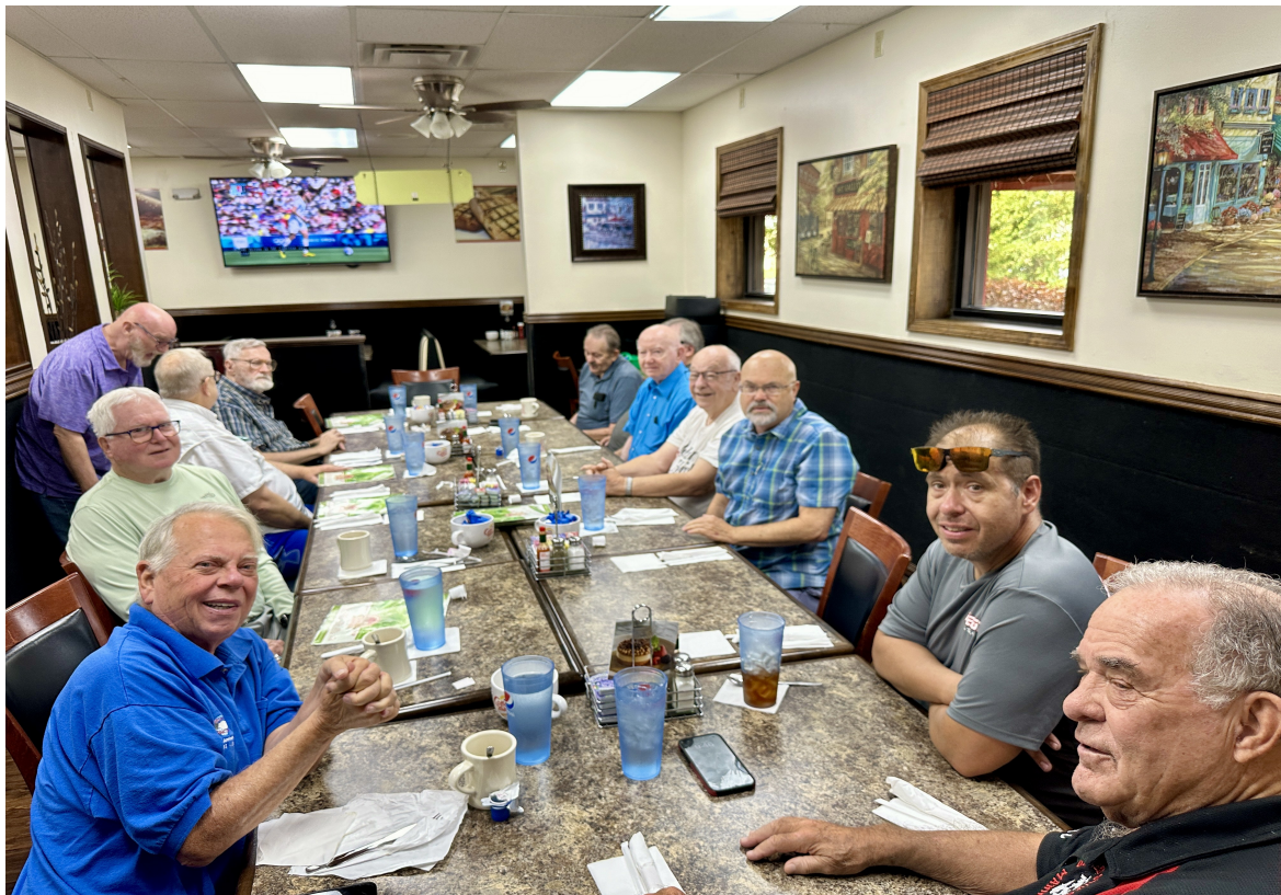
Prime Timers at breakfast