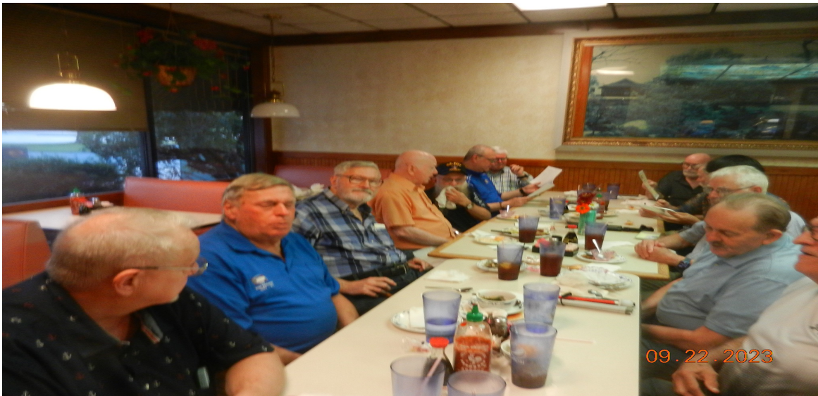
Anniversary party 2023