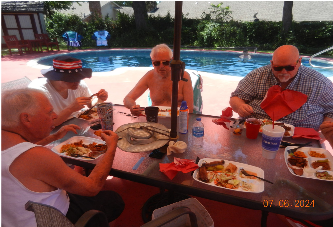
TAPT Annual Picnic