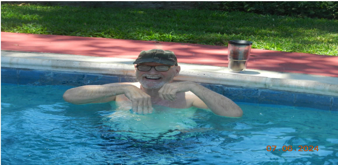
Prime Timer in the pool at TAPT picnic