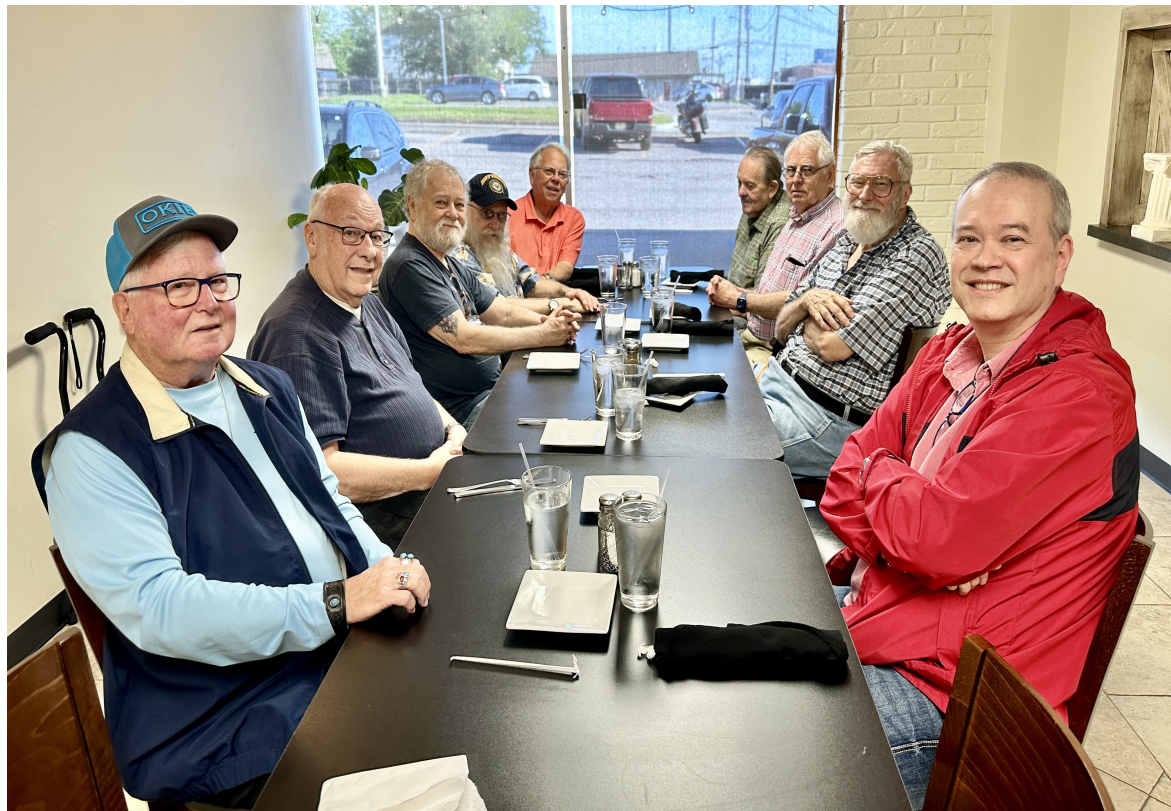
PrimeTimers happy to be together to break bread and good company