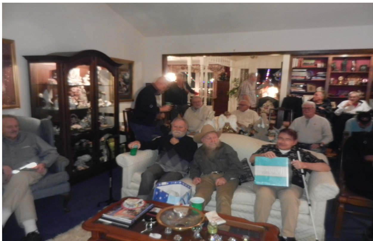
TAPT members at our annual Christmas Party.