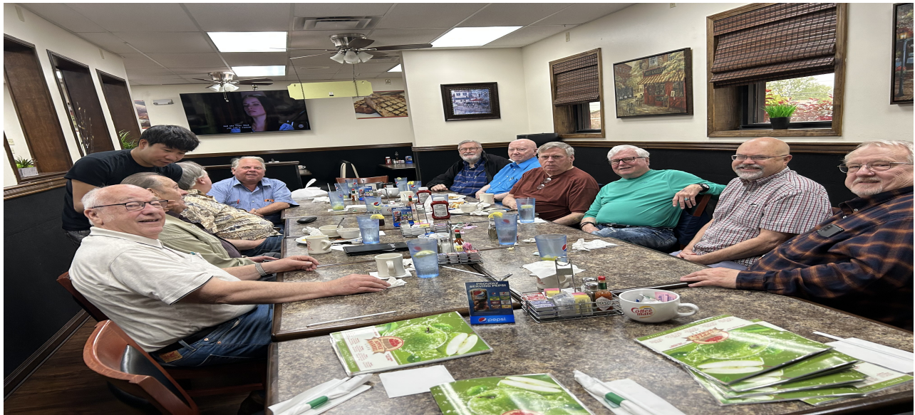
Prime Timers gathered for Friday breakfast