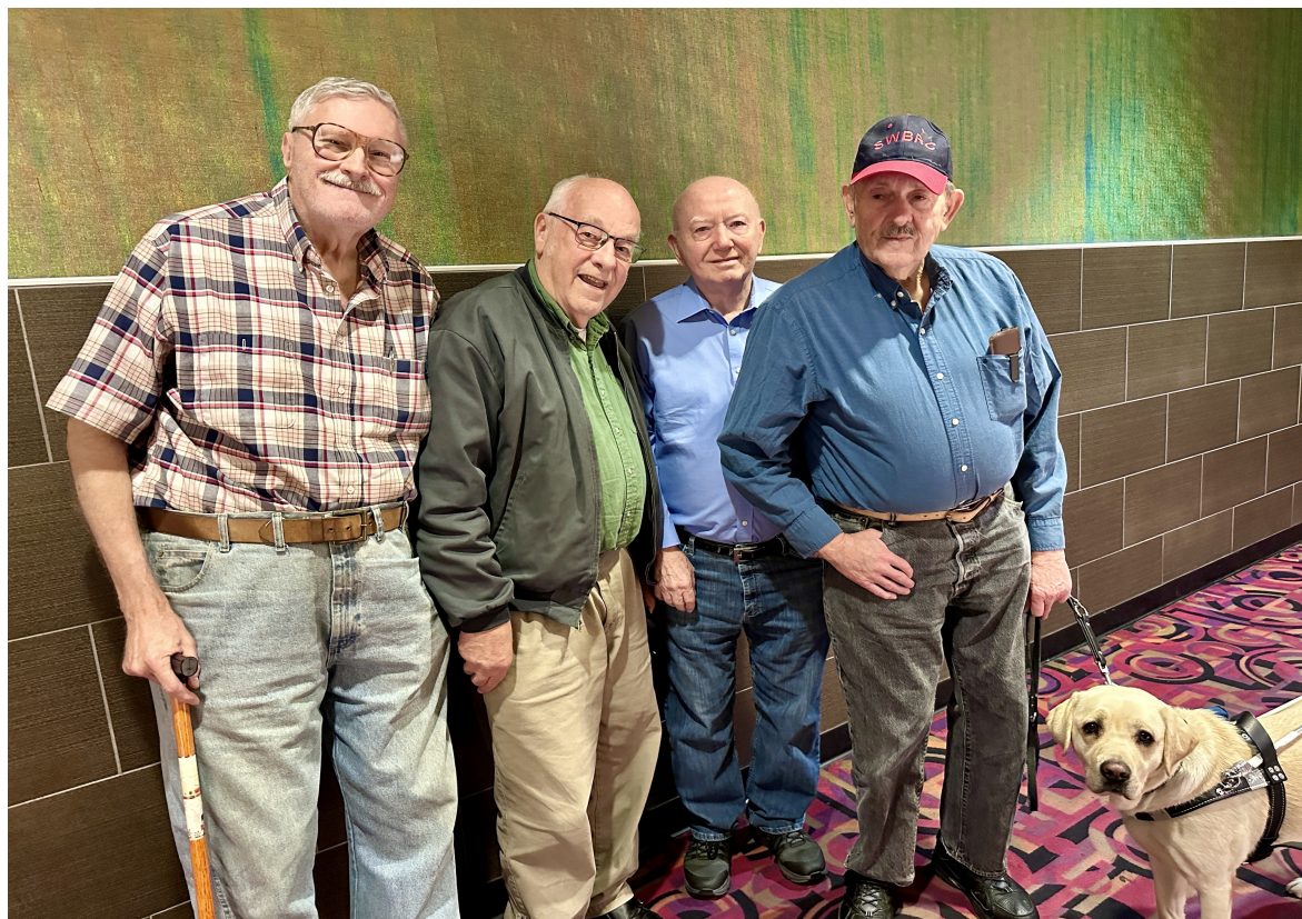
Prime Timers at the Movies