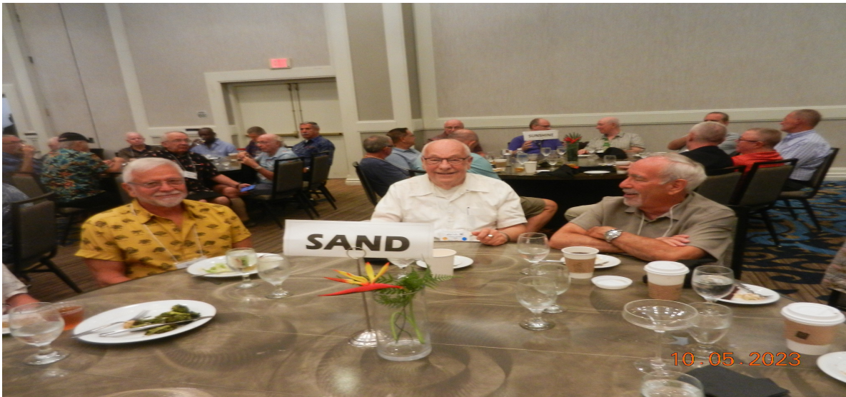
Your representative at the PTWW convention at closing night banquet October 5 2023