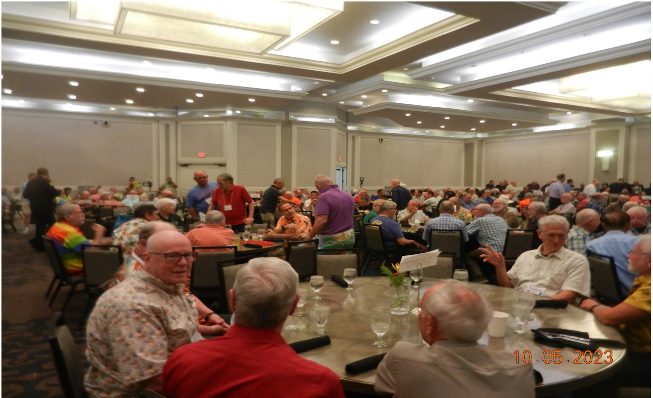
PrimeTimers at the 17 th PTWW bi-annual convention October 1 to October 5 2023