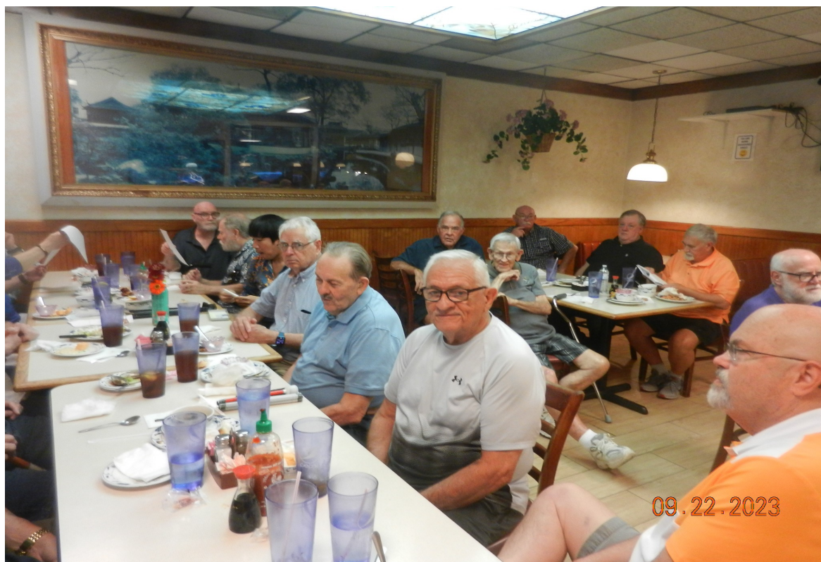
Prime Timer Celebrating 30 years