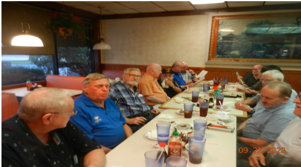
Prime Timer celebrating 30 years