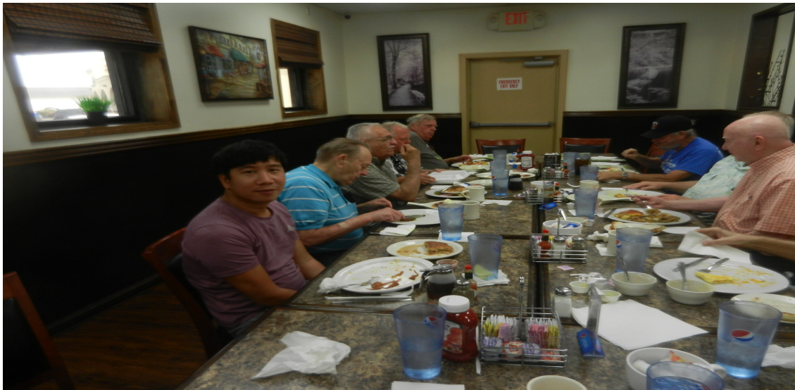
Prime Timers with food and fellowship.