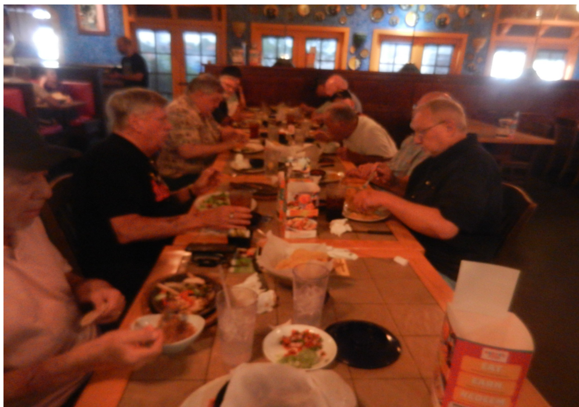
PrimeTimers enjoying food and company