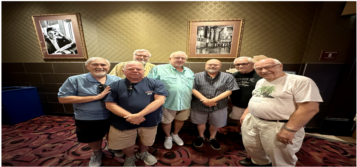
PrimeTimers at the movie.