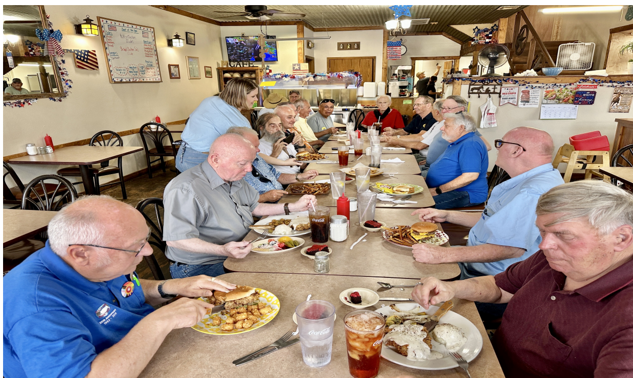
PrimeTimers breaking bread at tri-club gathering at Ralston Cafe.