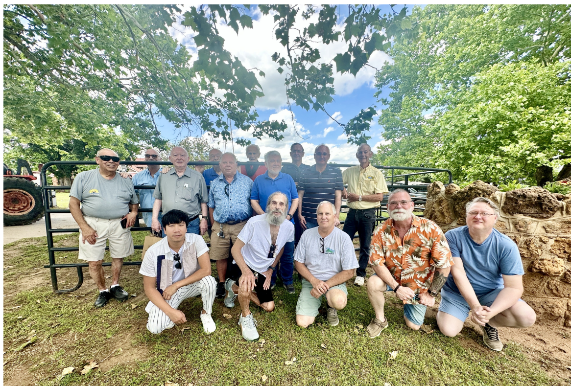
PrimeTimers at Tri-Club gathering at Pawnee. At Pawnee Bill Buffalo Museum.