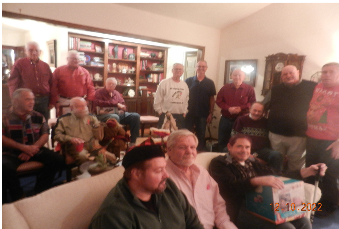
TAPT Christmas Party 2022 big smiles for Santa