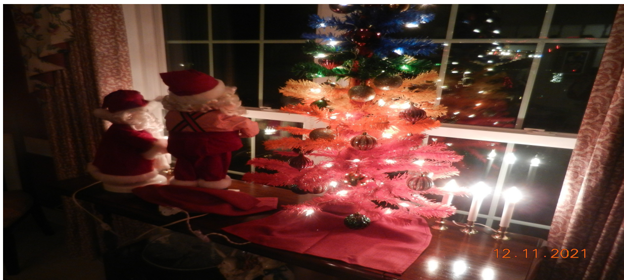
TAPT Christmas party is near Santa is looking out to welcome you in