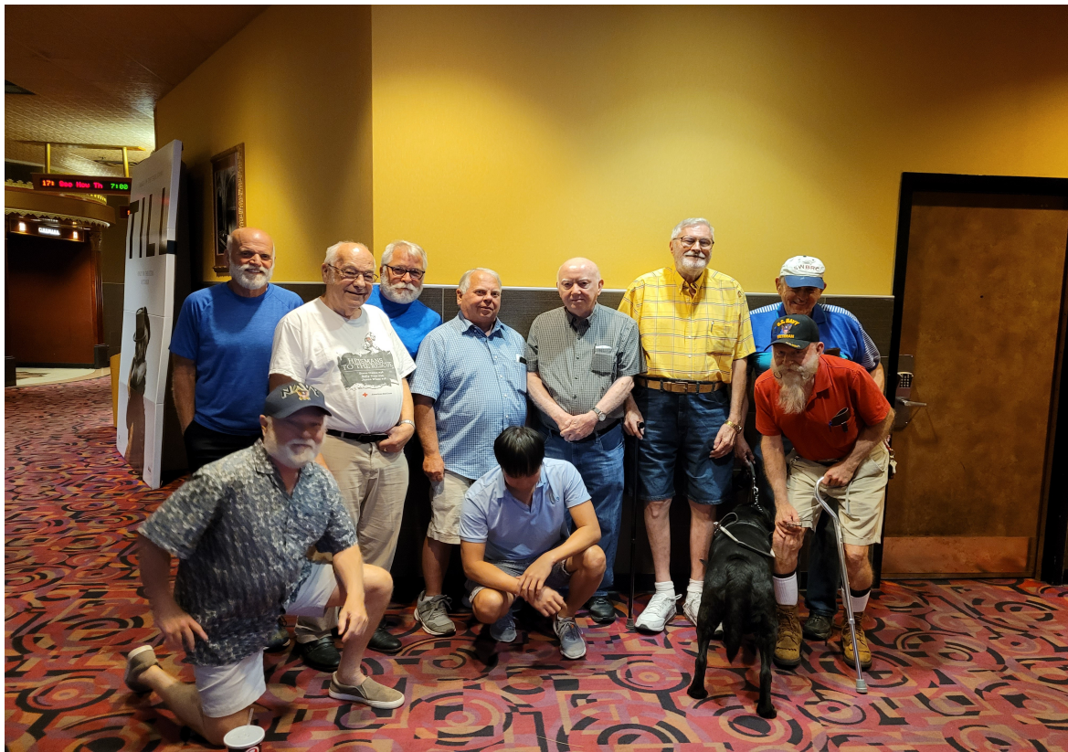
TAPT at the movies