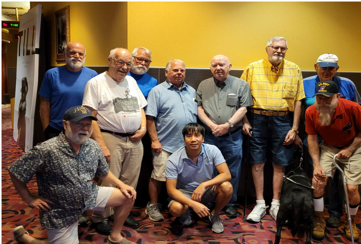
PrimeTimers at the movies