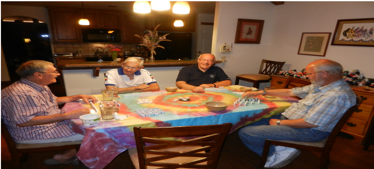
PrimeTimers game night from the past