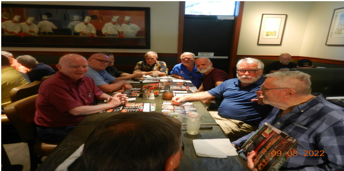
TAPT members celebrating our 29 th anniversary