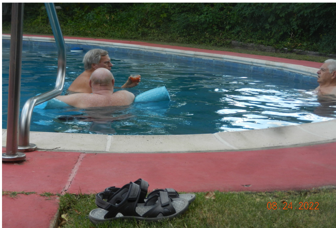
TAPT Pool Picnic toasting the water boys