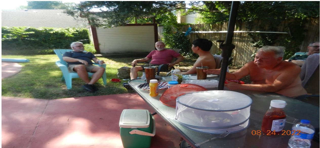
Prime Timers enjoying the shade after a meal