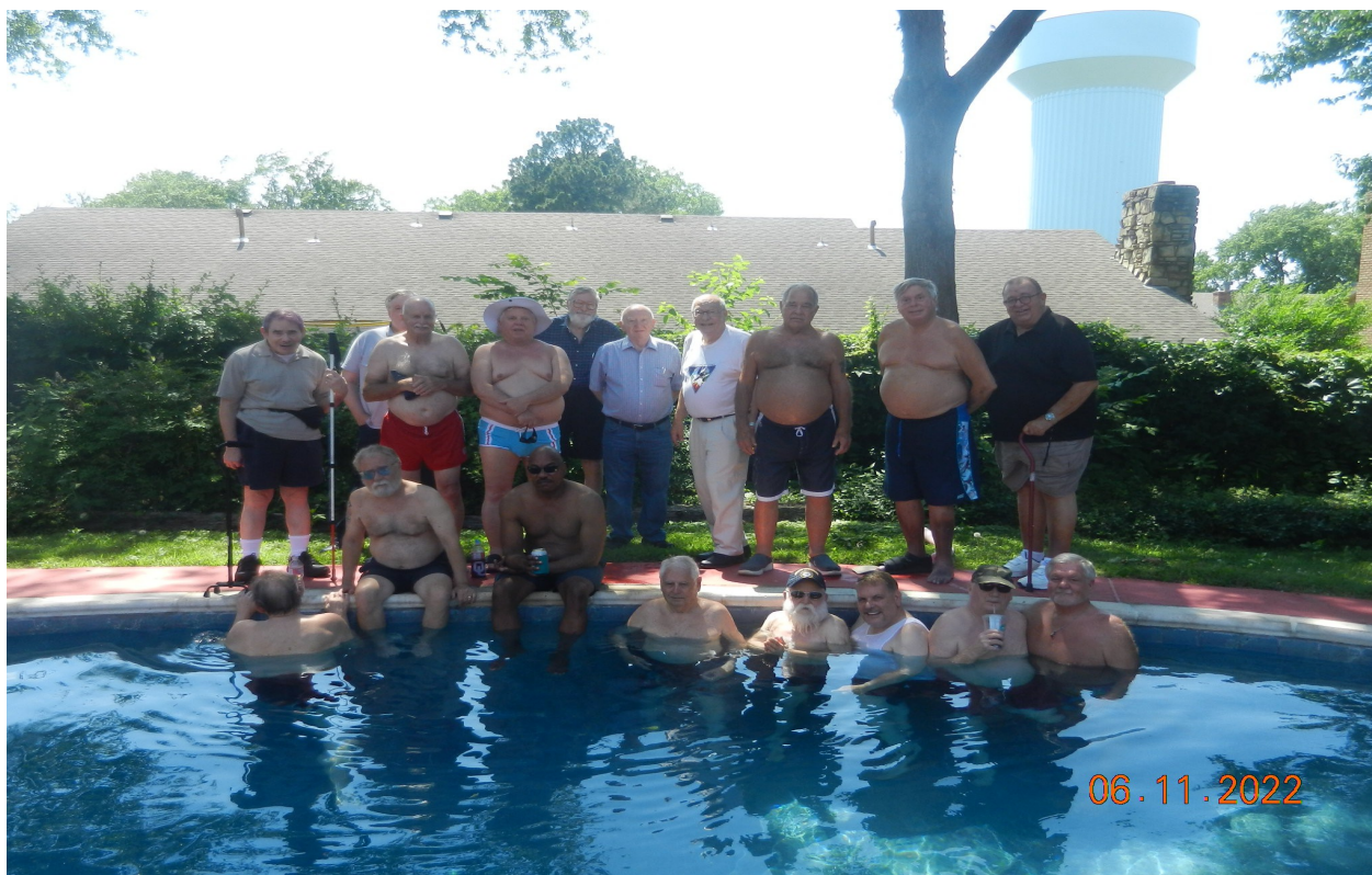
Prime Timers at TAPT annual picnic June 2022