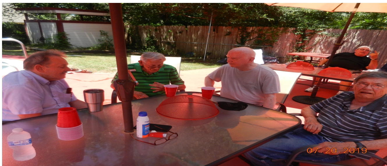
From the history files Prime Timers enjoying some chit chat.

ANSWERS OF A BRILLIANT STUDENT WHO OBTAINED 0%