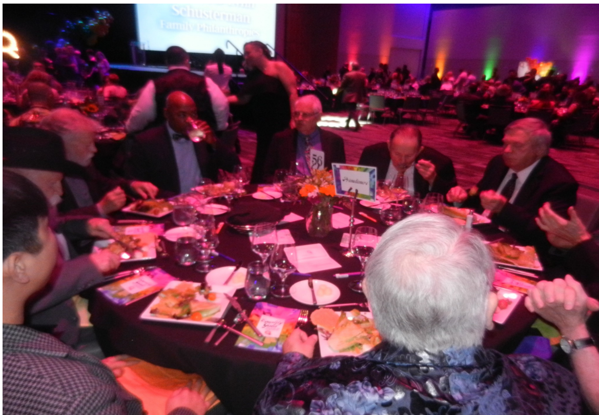
TAPT at OKEQ Gala 2022