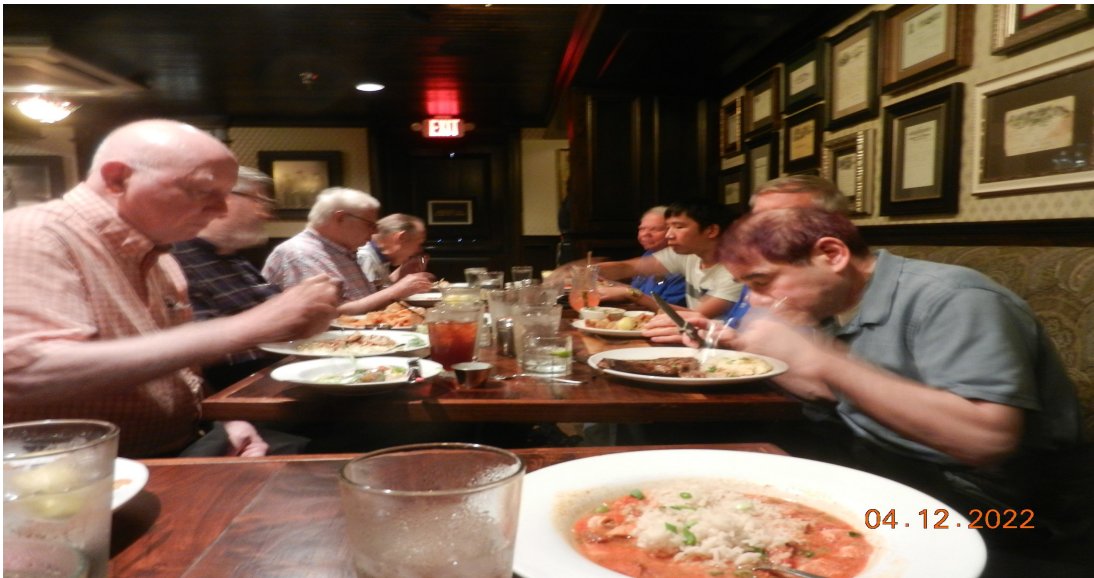
Dinout at Nola's