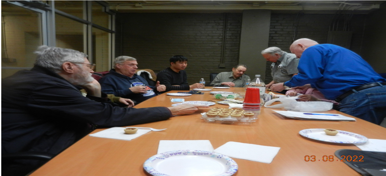
The benefit for attending the TAPT monthly meeting