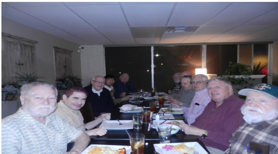
PrimeTimers dining out March 10 2022