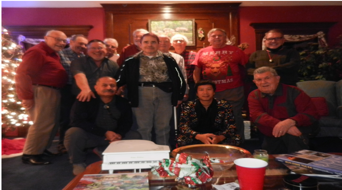
Prime Timer's at our Christmas party