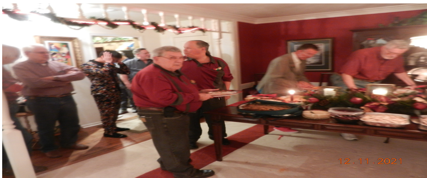
Prime Timer's enjoying a Christmas feast.