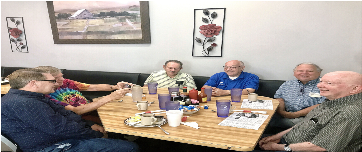
TAPT at breakfast in October