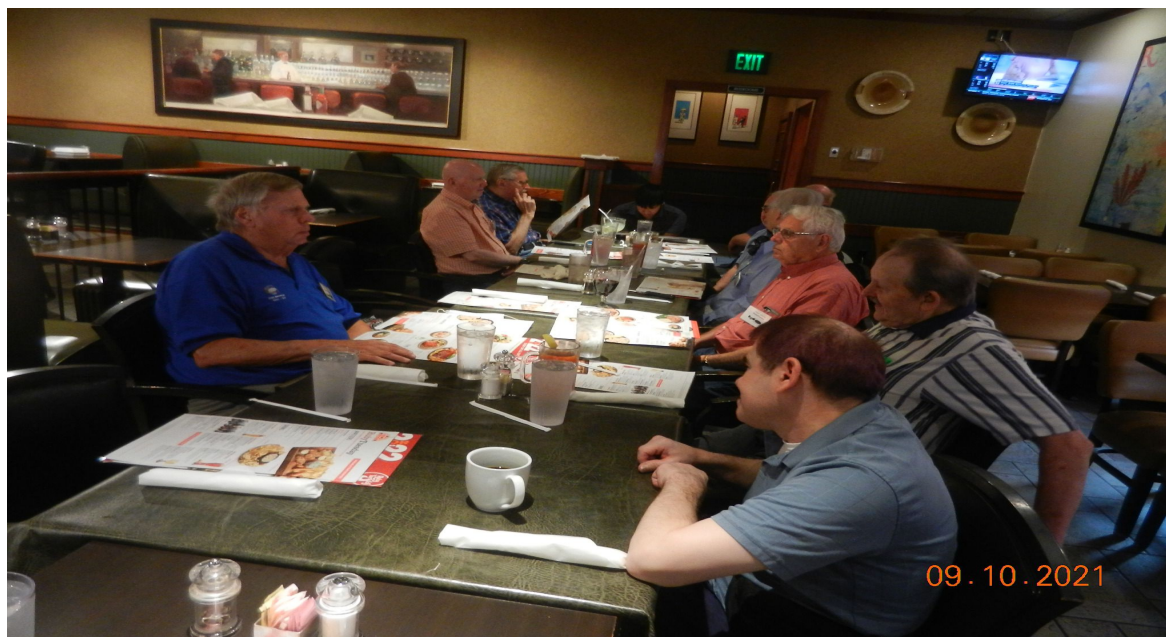
TAPT bring in the 29 th year.