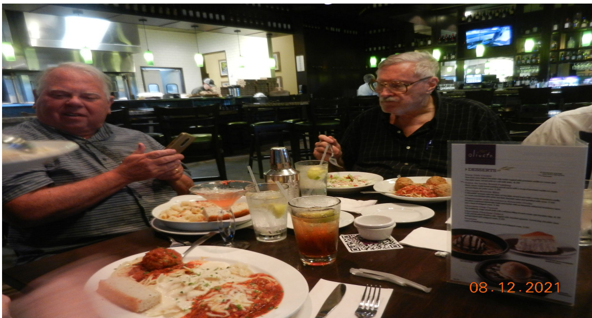
Prime Timers dining out Italian