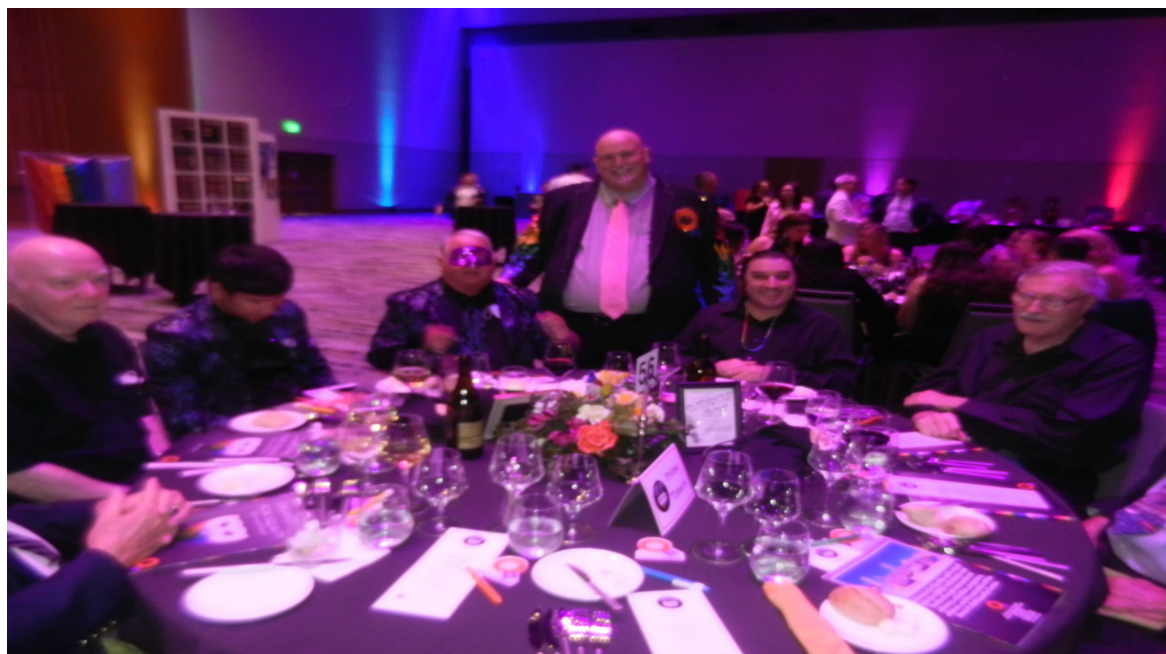
TAPT celebrating the return of the OKEQ Gala 7-17-2021