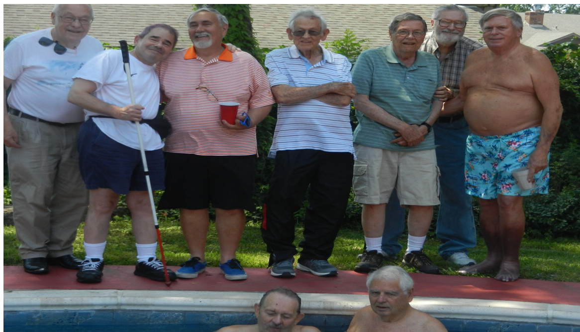
TAPT Annual Picnic 6-19-21 Best Prime Timers in Oklahoma!!!!