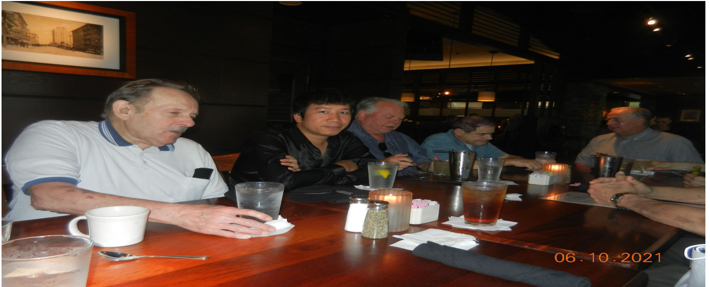
TAPT Dine out Happy Prime Timers just waiting to eat.