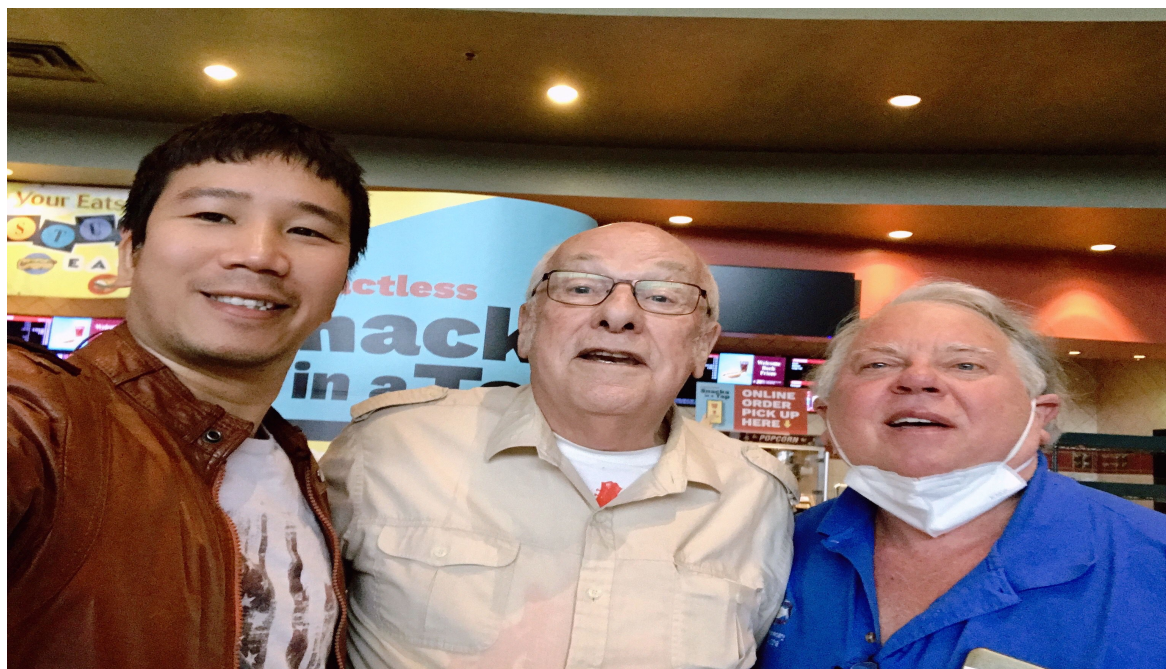
Prime Timer's at the movie Jeff John Bob