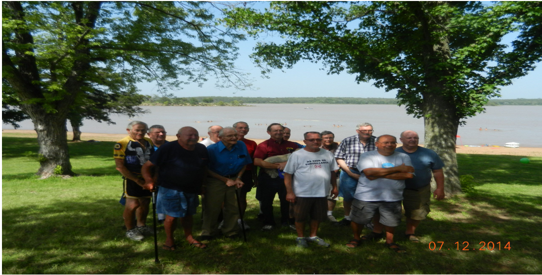
TAPT at the lake. Oh we were youngsters then!!