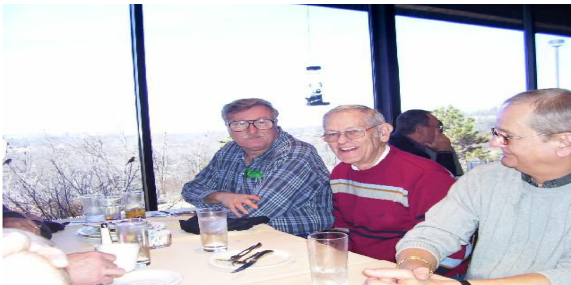
TAPT Dineout at the Gilcrease Museum in 2014