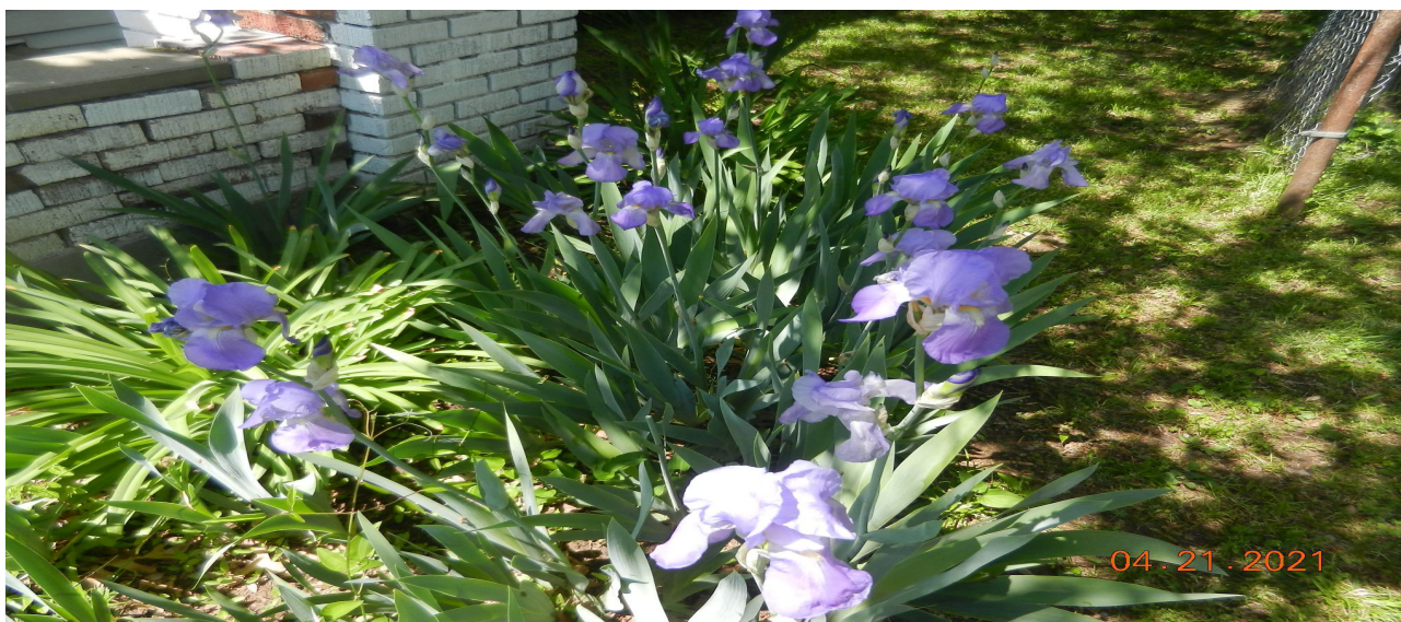
April showers bring May flowers the Iris shook off the freeze.