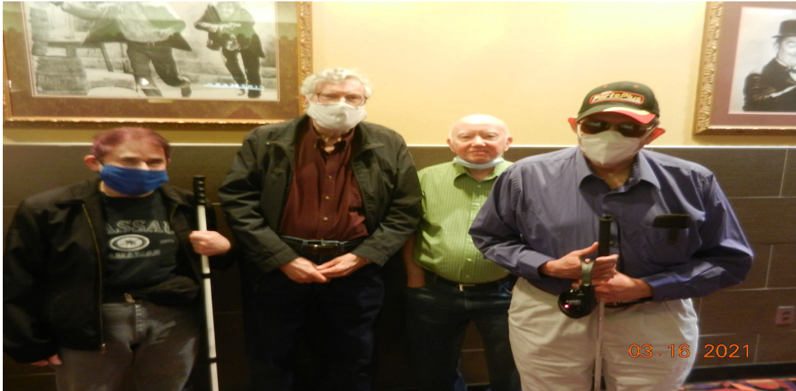
Prime Timers after the movie