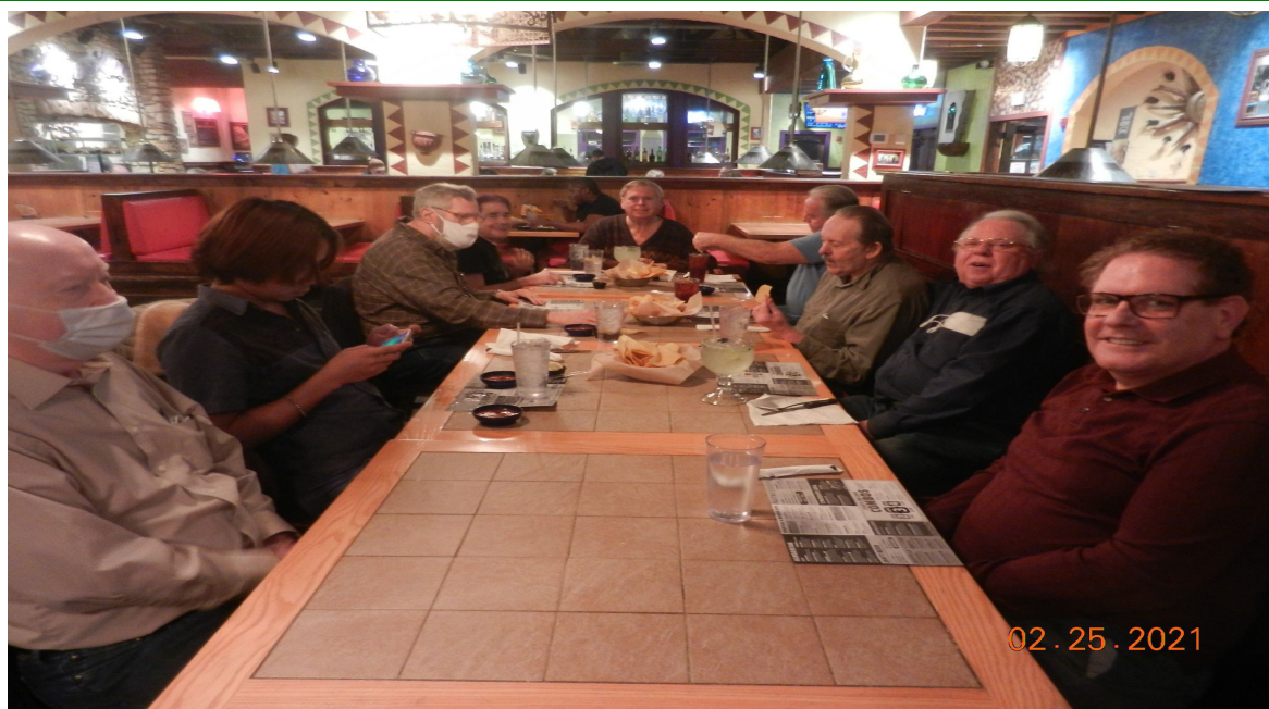
Prime Timers at Dineout after the big freeze.