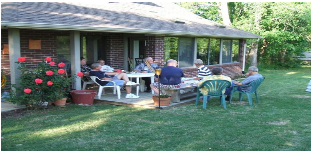
Prime Timers enjoying the best of Tulsa.