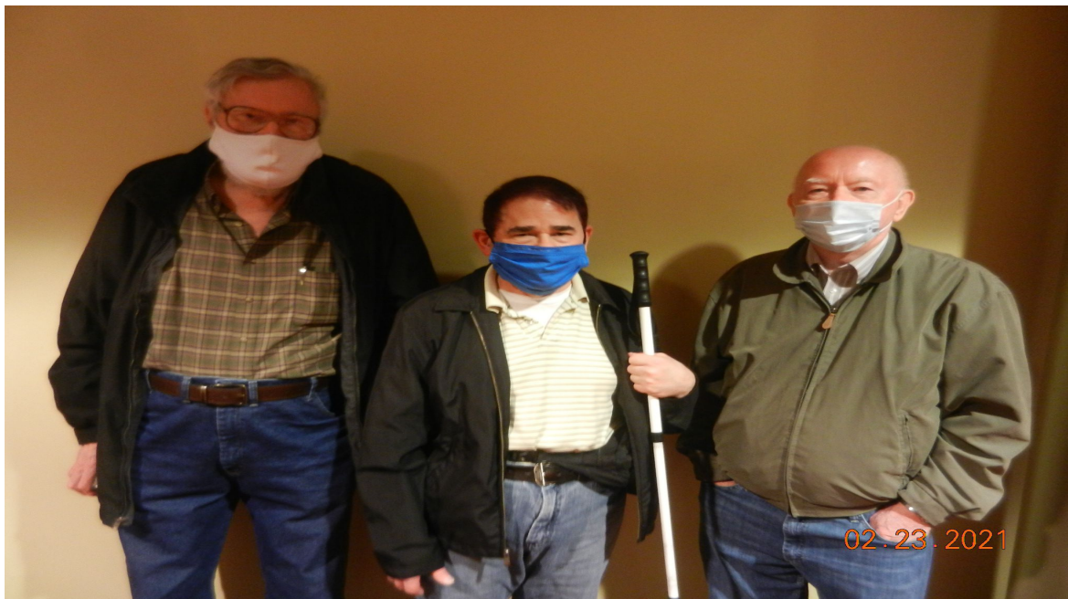
Prime Timers at the movie.