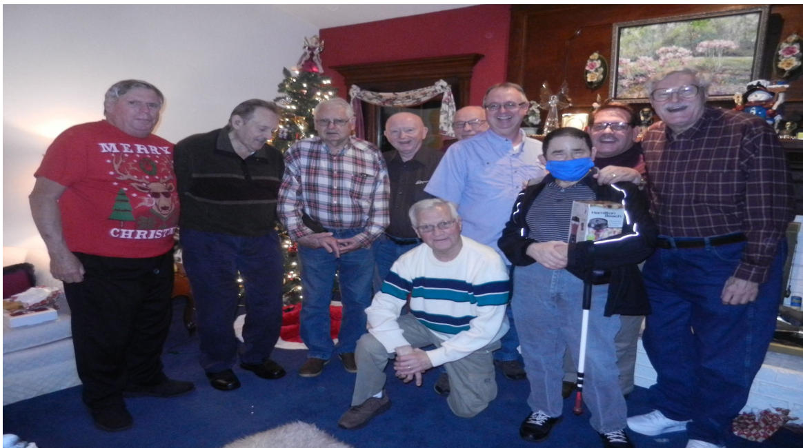
TAPT members at the annual Christmas party 2020 with big Ho Ho to all