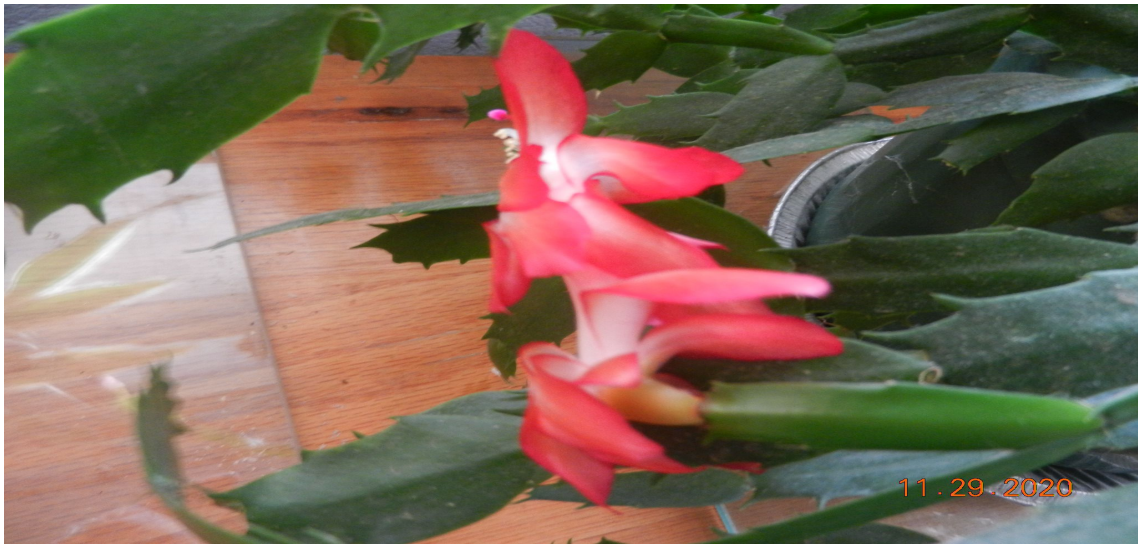
My Christmas cactus 2020