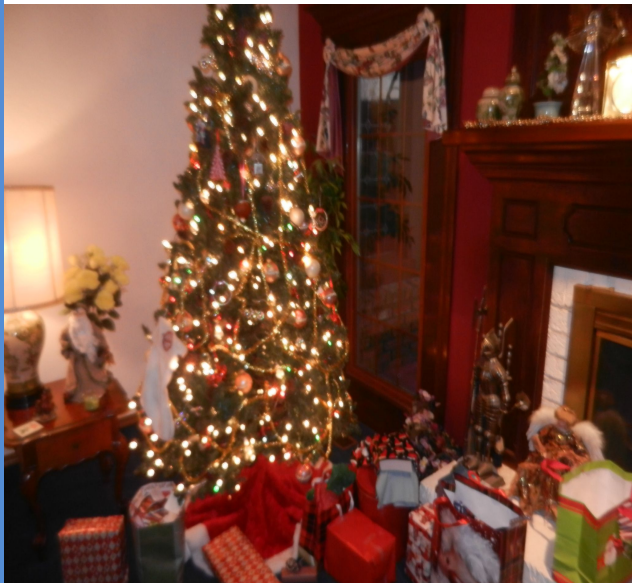
TAPT Christmas party. Santa arrived early for club dirty Santa exchange. We had a few gifts stolen.