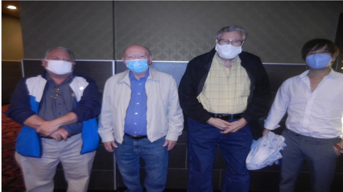
Prime Timers at the movies in November it was a spy pic