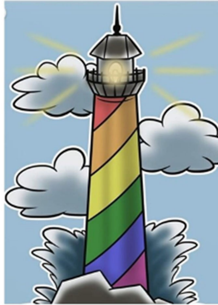
HSPT-Reno Lighthouse Supporting our members through care and outreach.

Members seem more than willing to share their life’s stories and personal perspectives.