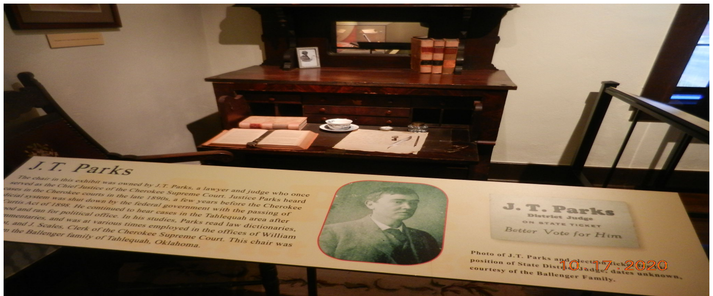
Trip to Tahlequah visited Cherokee Court House

My three year old great-grandson and I spent the day reading, watering flowers, and baking cookies. As he sat on a stool in front of the oven waiting for the cookies, he turned to me with a sense of excitement and announced, "This is the greatest day of my life!"