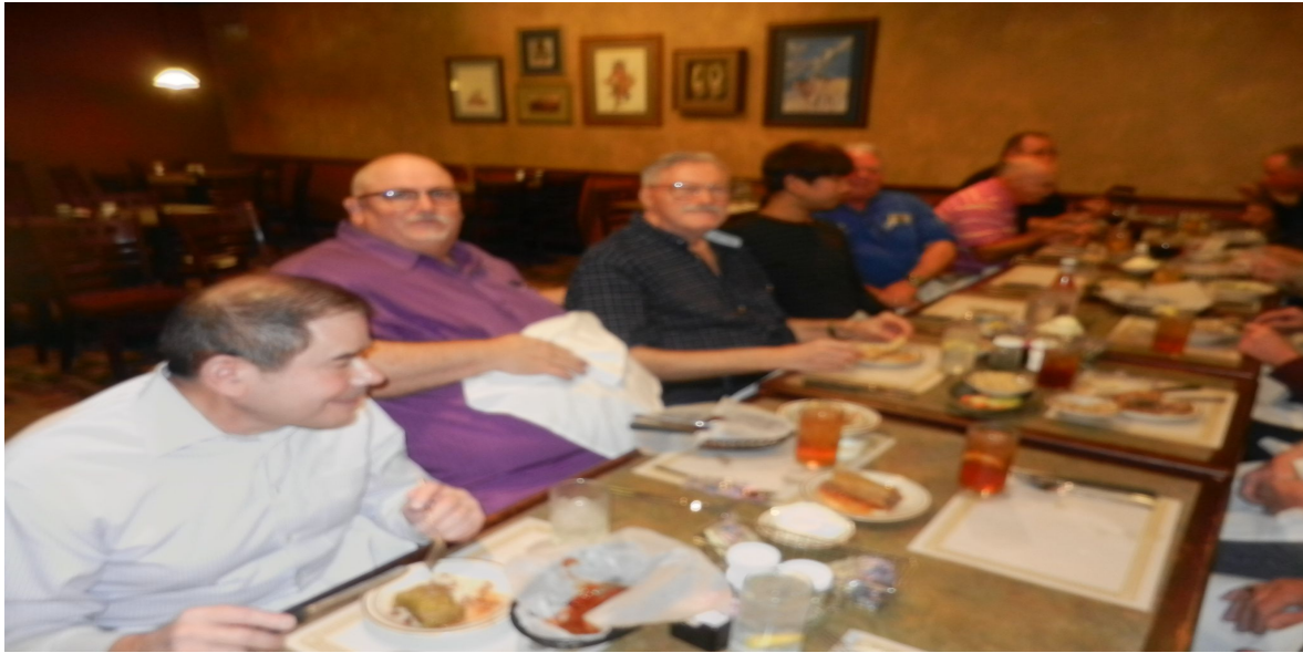
Prime Timers celebrating the past year and welcoming our 28 th year.