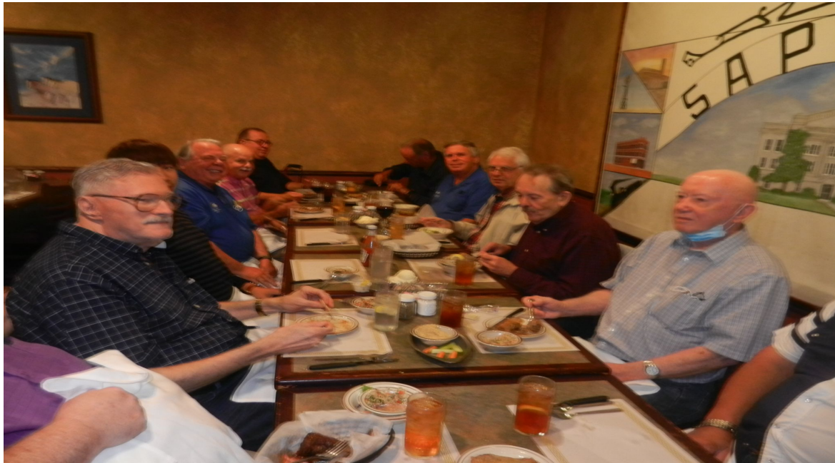
TAPT Anniversary Party 2020 at Freddie's