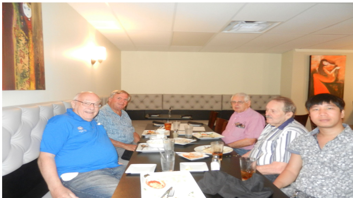
Prime Timers at our monthly dine out.