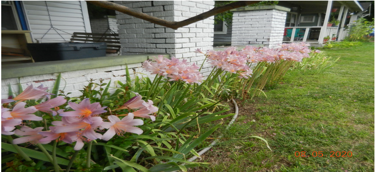
Flowers do bloom in Tulsa. Thanks to cooler summer

When I was stationed in Wurzburg Germany, I ran several miles every day along the beautiful Main River. Once, several fellow lieutenants, all men, joined me. For the first half of the run I was able to keep up with them. However, on the return I started to fall behind.