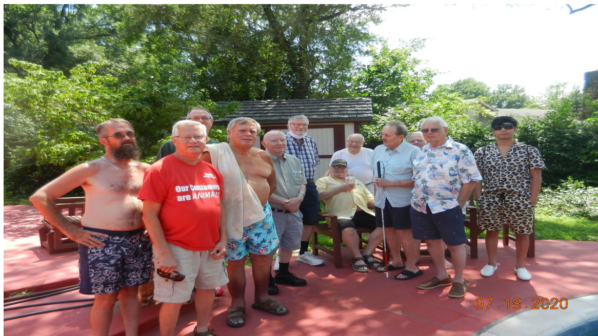
TAPT 2020 annual picnic