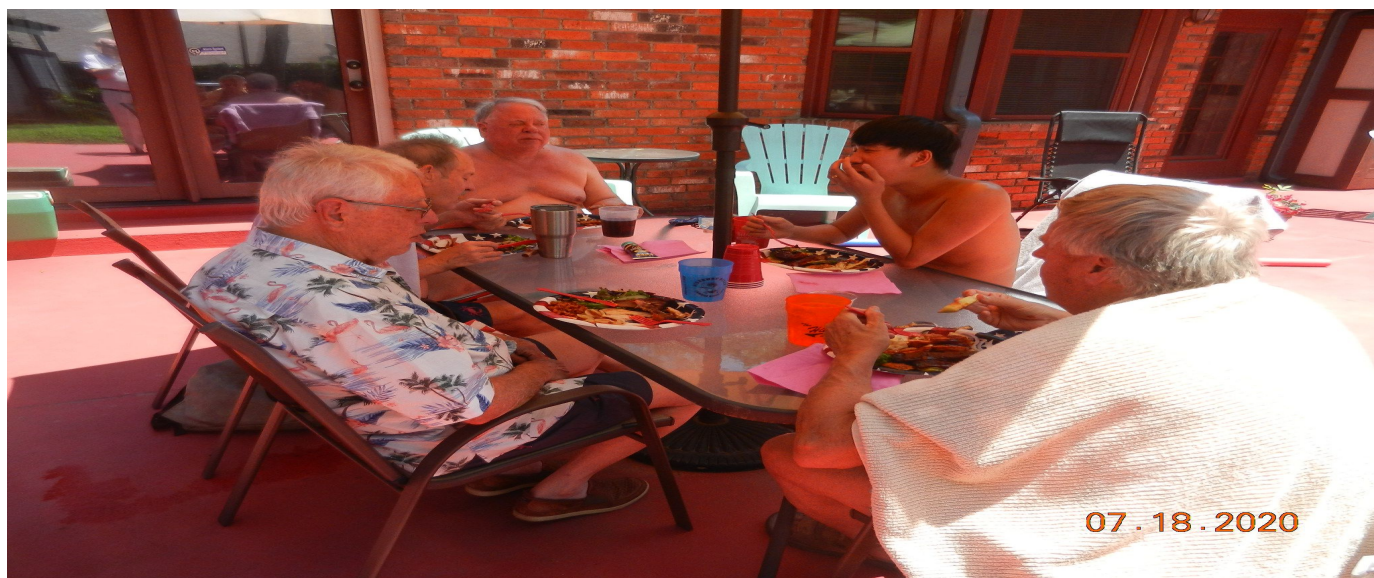
TAPT members enjoying picnic lunch