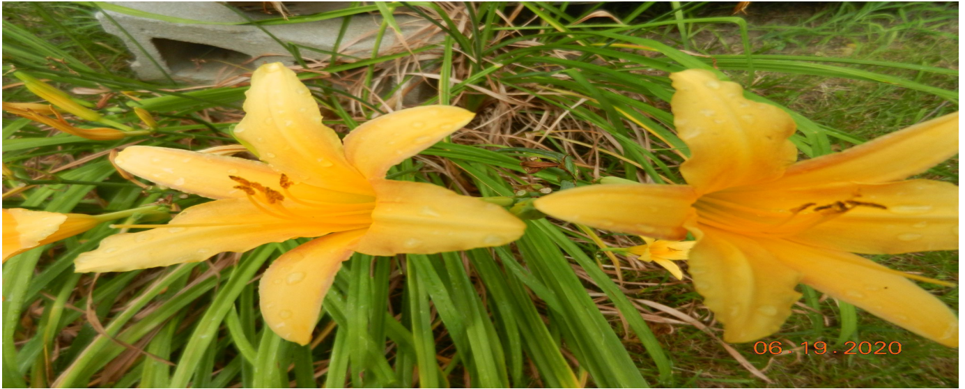
June flowers from my back yard.