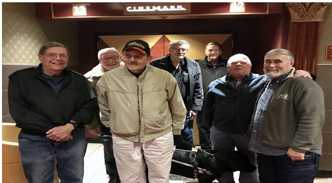
Prime Timers at the movies