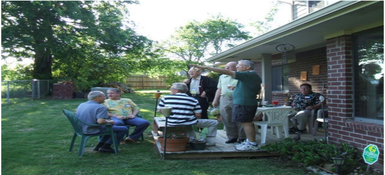
Reminder Tulsa can be warm. Pic from the past!