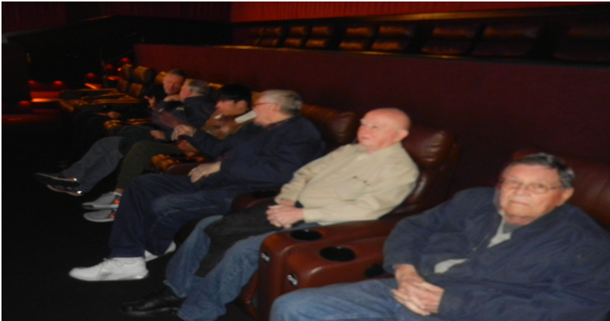
TAPT members out to see "1917"