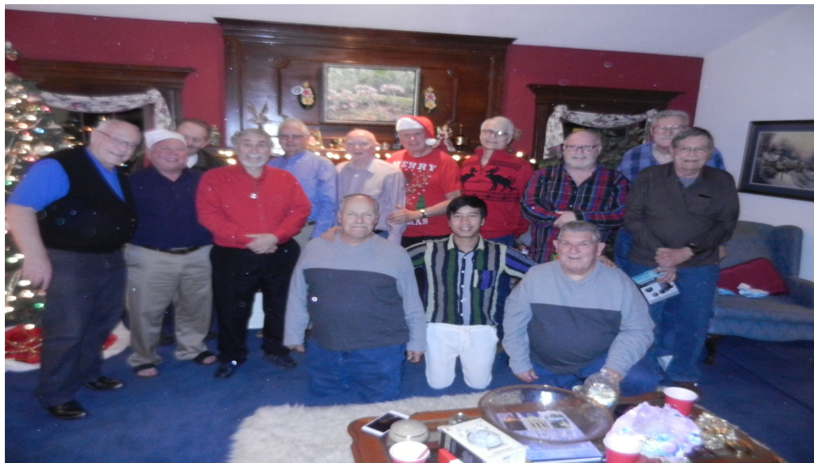
Christmas Party 2019