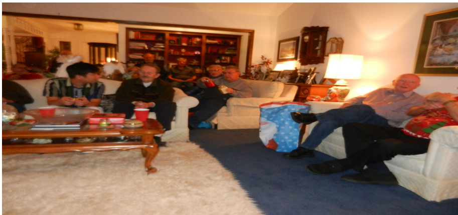
Santa about to arrive.