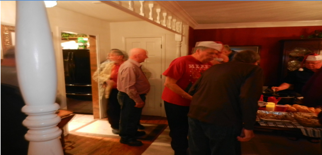
PrimeTimers lining when the dinner bell rang