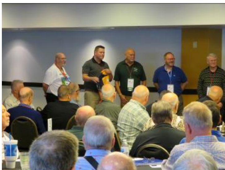
Members of the 'Web Tigers'