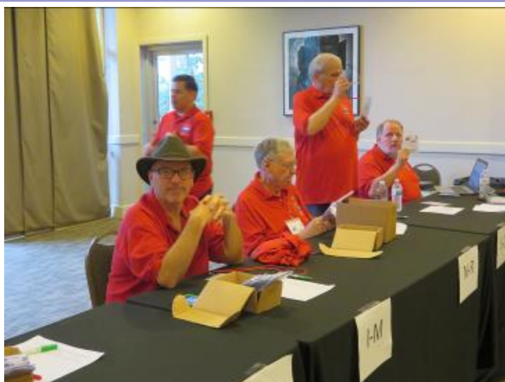
Convention volunteers from San Antonio Prime Timers