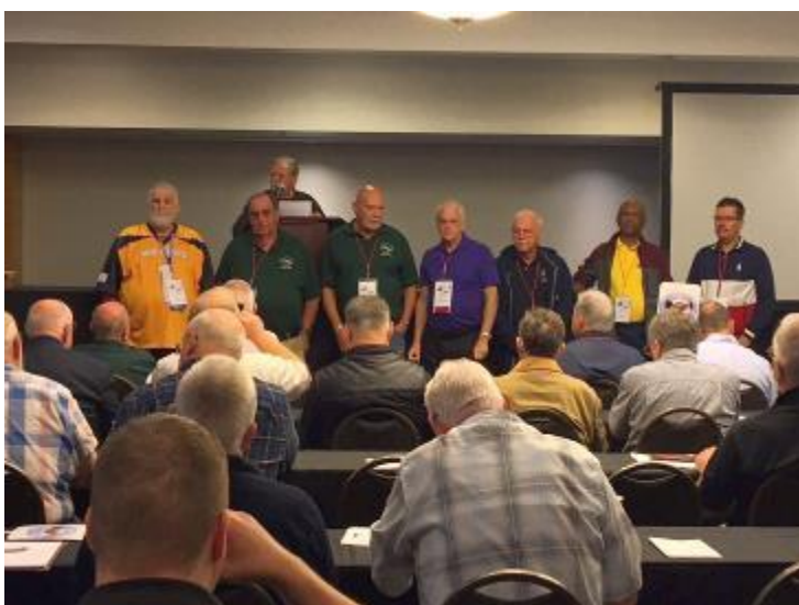
General Meeting with 2019-21 PTWW board members