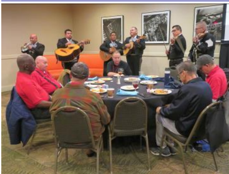
Mexican lunch buffet with performers