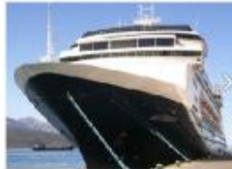
HOLLAND AMERICA ROTTERDAM

SAT. OCT. 17 Barcelona ARRIVE DEPART SUN. OCT. 18 At Sea 5:00PM MON. OCT. 19 Cadiz, Spain. 8:00AM 11:00PM TUES. OCT. 20 Tangiers, Morocco 8:00AM 5:00PM WED. OCT. 21 Casablanca. 8:00AM 8:00PM Thurs. OCT. 22 At Sea FRI. OCT. 23 Funchal, Madeira. 8:00AM OVERNIGHT SAT. OCT. 24 1:00PM SUN. OCT. 25-Oct. 31- At Sea. MON. Nov. 1 - Ft. Lauderdale. 7:00 AM