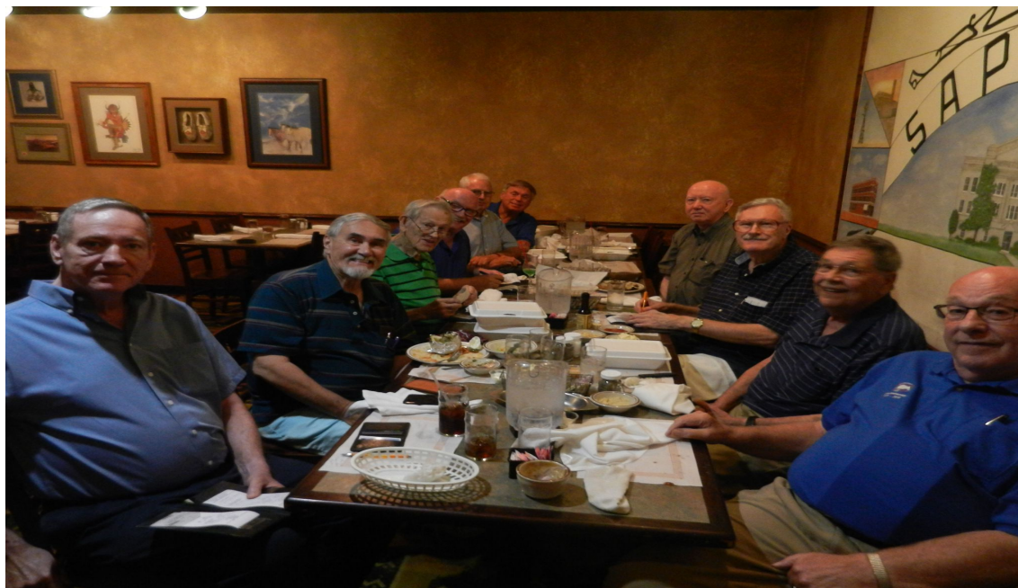
TAPT members at 26 Anniversary party