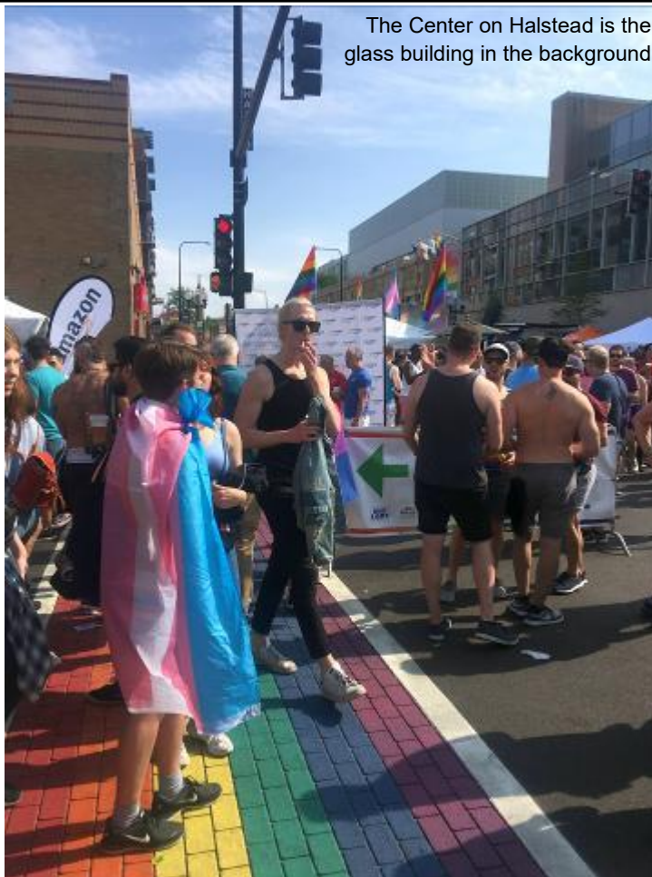
The Center on Halsted is the glass building in the background