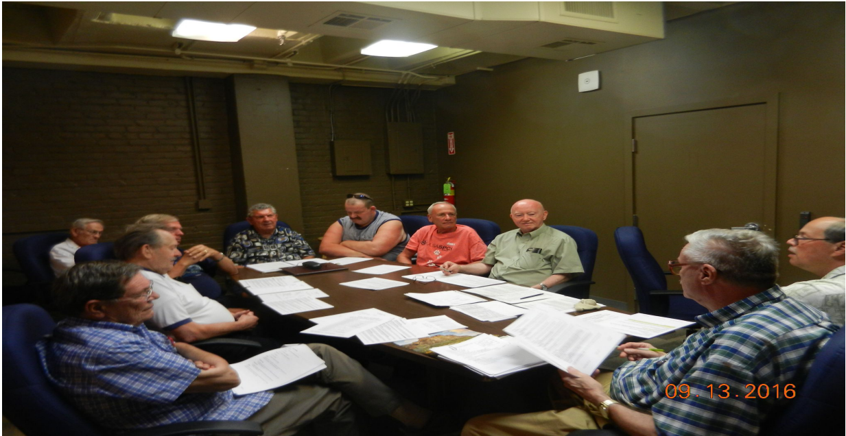
A picture of TAPT membership from the past. How young we were.