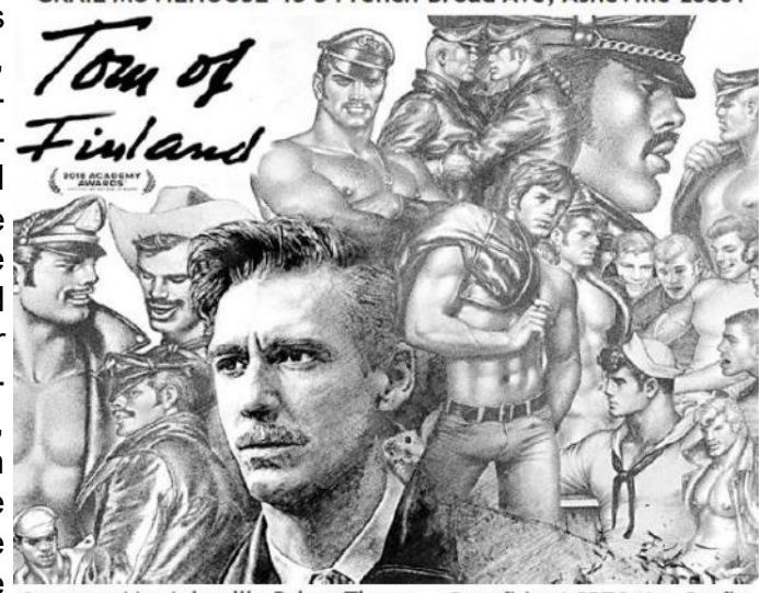
Sponsored by Asheville Prime Timers •Benefiting LGBTQ Non-Profits

September 27, Thursday = 7:30 Pm GRAIL MOVIEHOUSE 45 S French Broad Ave, Asheville 28801