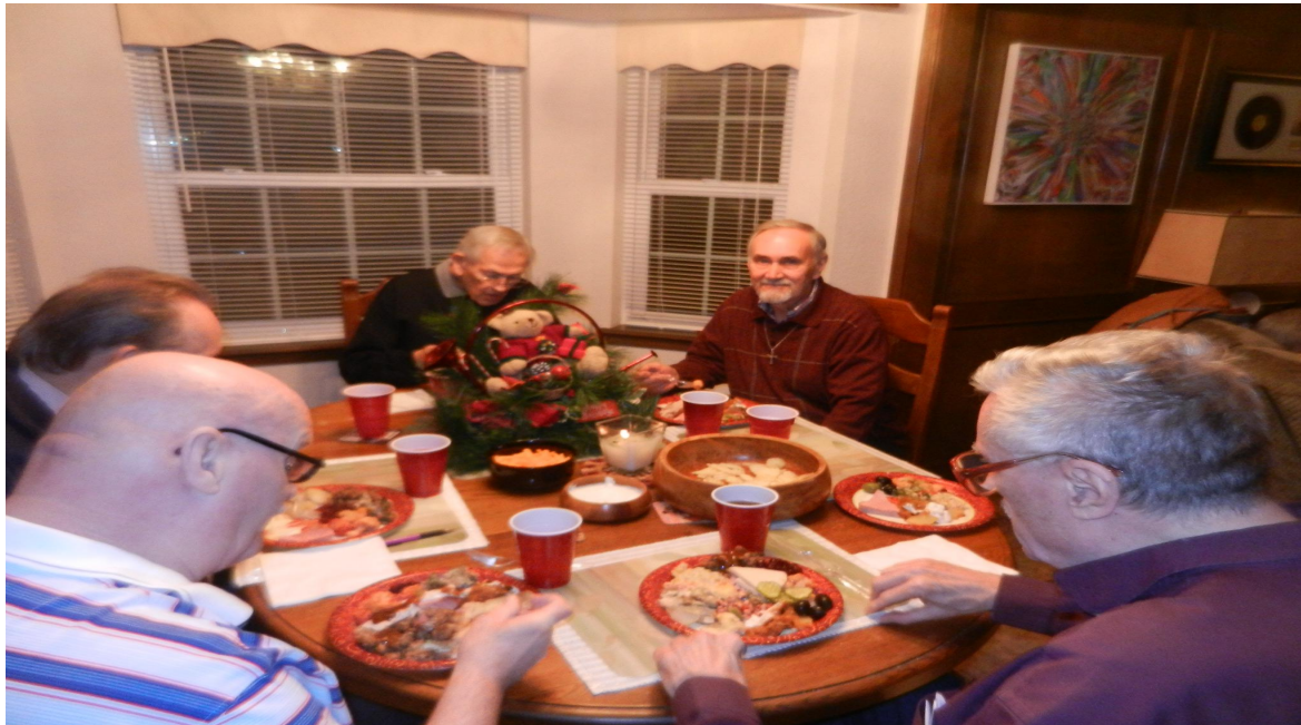
Christmas Time with Prime Timers